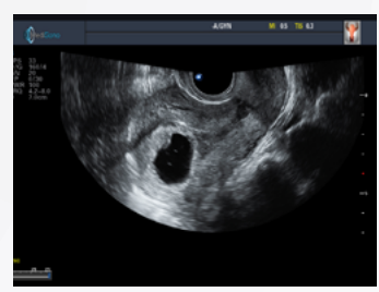
Endocavity Early Pregnancy