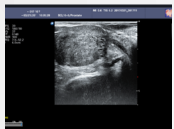
Prostate Linear Scanning Biplane Probe

The broad array of probes available with high frequency ranges of up to 17Mhz and the built-in advanced imaging technologies allow the easy acquisition of the highest image resolution and color sensitivity with only minor adjustments. Even for difficult patients and interventional applications, the P12 Plus offers immediate adjustments given its intuitive keyboard workflow. The 13" touch screen allows quick and accurate command selection automatically adopting the range of commands for the application in use.