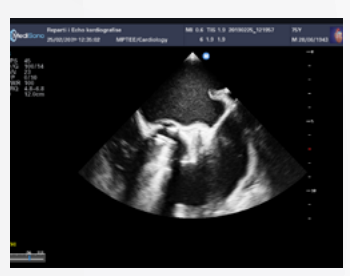
MPTEE Transesophageal Echocardiography views